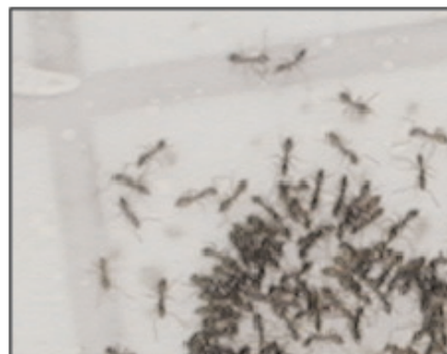
Ants instinctively find spilled food and can contaminate foods in unsealed packages.

This is the most common urban ant we deal with in Western Exterminator Company's service area.